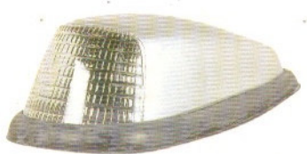
80019000 – Incolor Lamp