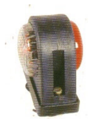
80026070 – Rubber Body, uncolored / Red lens 2 Poles